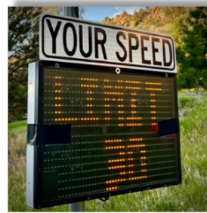
Duct tape over warning lights