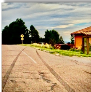
High speed skid marks, Rox Dr